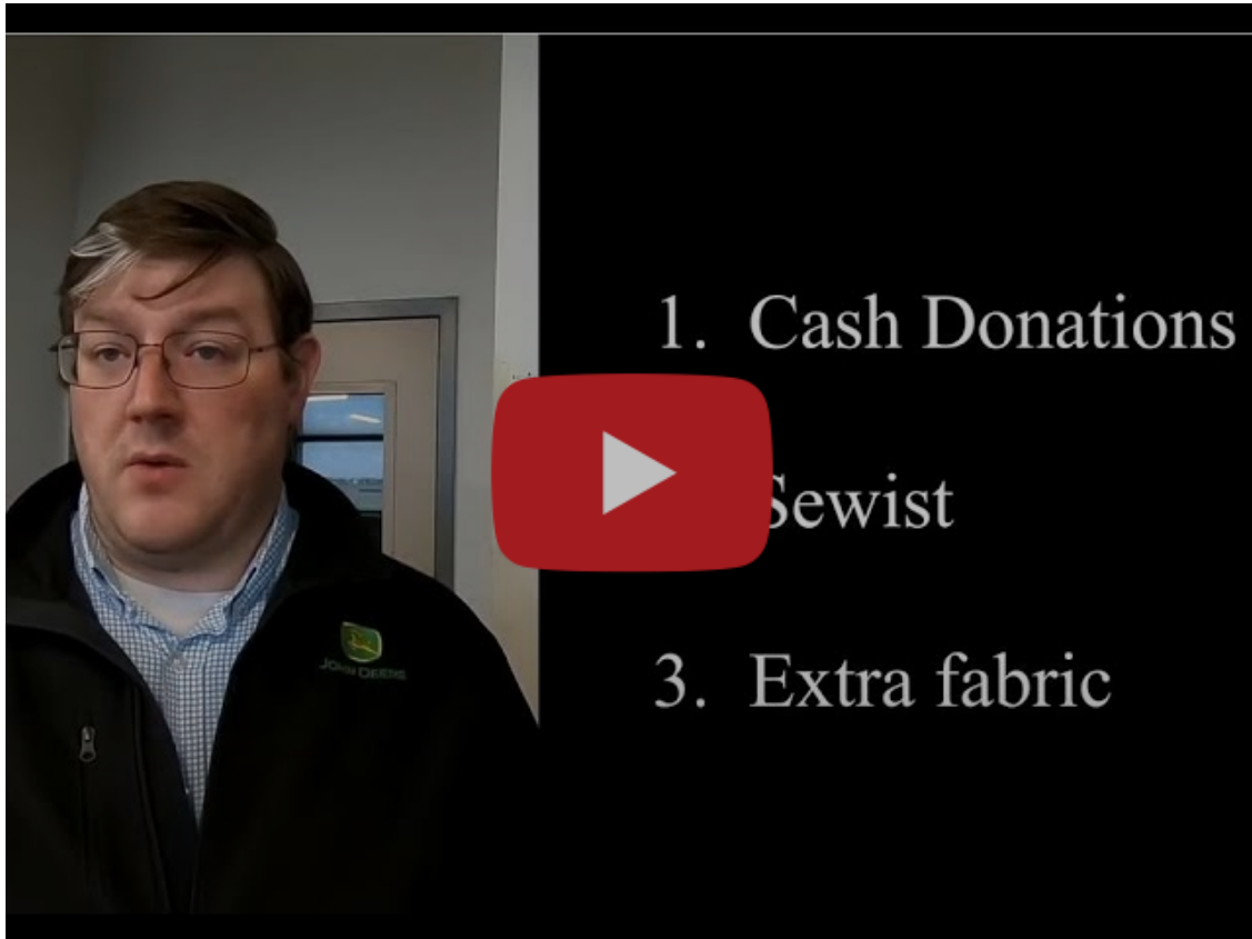
10,000 Mask Campaign